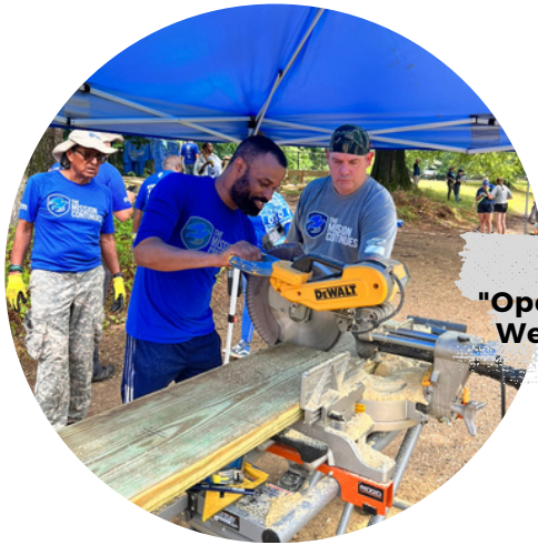
The Mission Continues "Operation District Drilldown" Week-long Service Initiative