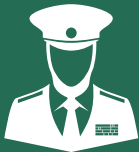
Veterans in Finance Networking Event

Our team facilitated and hosted 6 in-person events throughout New York, Chicago and San Francisco, impacting more than 100 veterans .